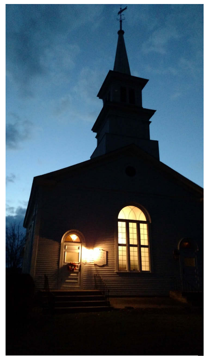
Good work and goodnight!