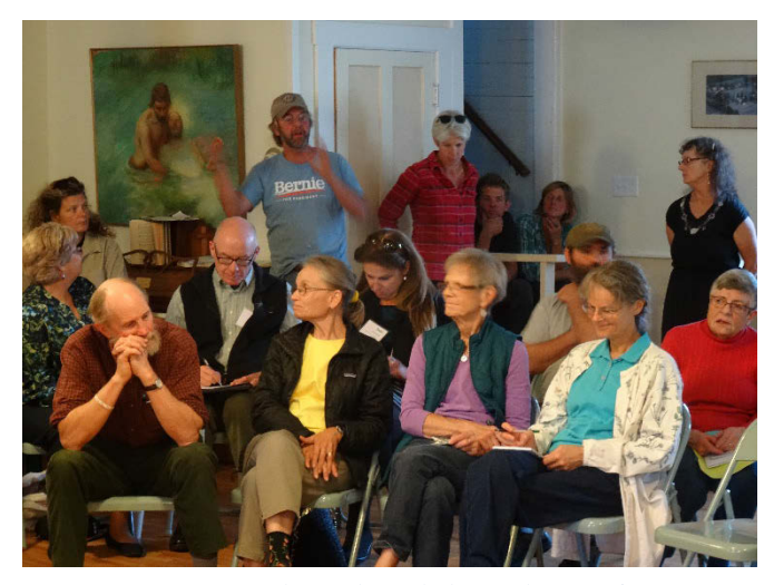
Community members shared their ideas at forums with Visiting Team members.